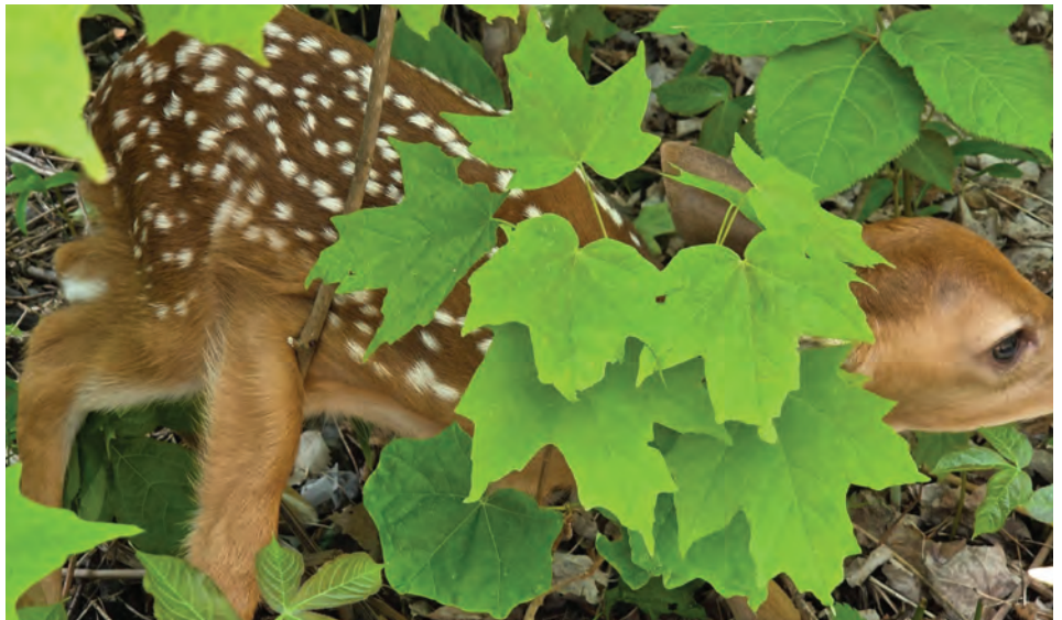
The fawn hidden on the Sporting Clay course