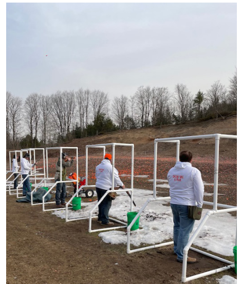
The Newman Bellant Crew, ready to go!