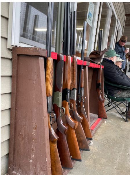
Ready to go, safety first