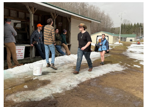
Soaking up the sunshine!