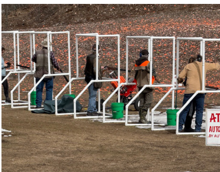
The sea of orange, scatter with some green