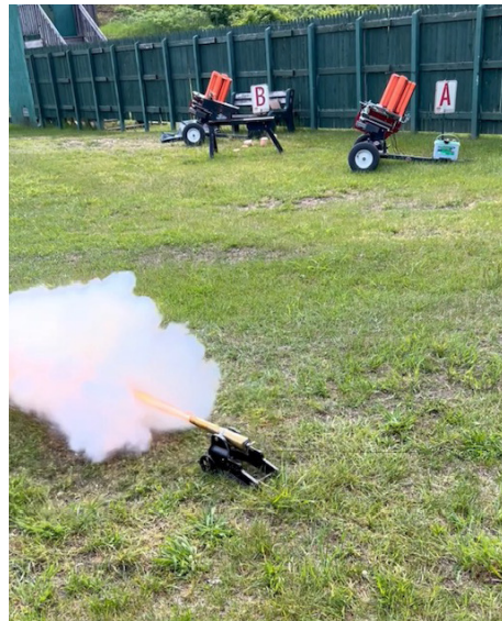
Starting the season off with a Bang