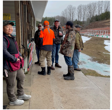
Let's get this party started