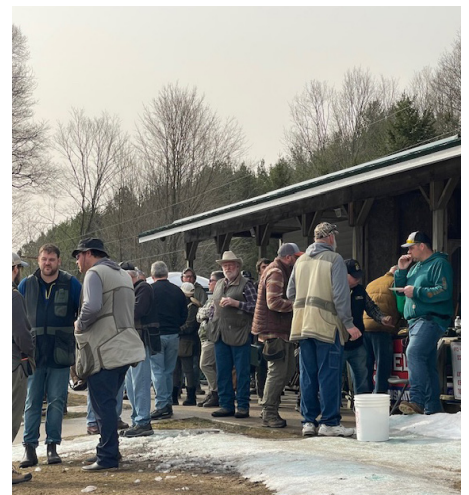
Perfect say to get out and enjoy the reconnecting with other members and guests